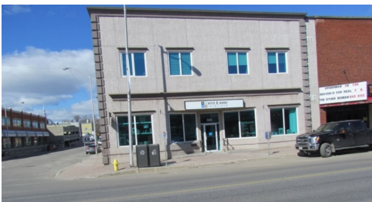
326 2nd St. S. Palace Theater -Bergman & Nelson-Bergman Building